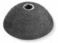
REFLECTION INTERFIT™ NH