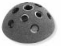
REFLECTION INTERFIT MH