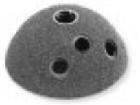
REFLECTION INTERFIT TH